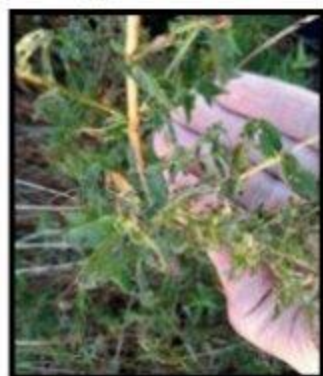
Plants on Central Island Showing Limited Herbivory on 10/6/16