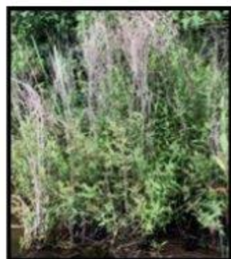
Figure 7: Moderate Herbivory on 7/25/20